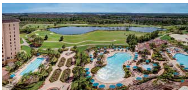
Rosen Shingle Creek®