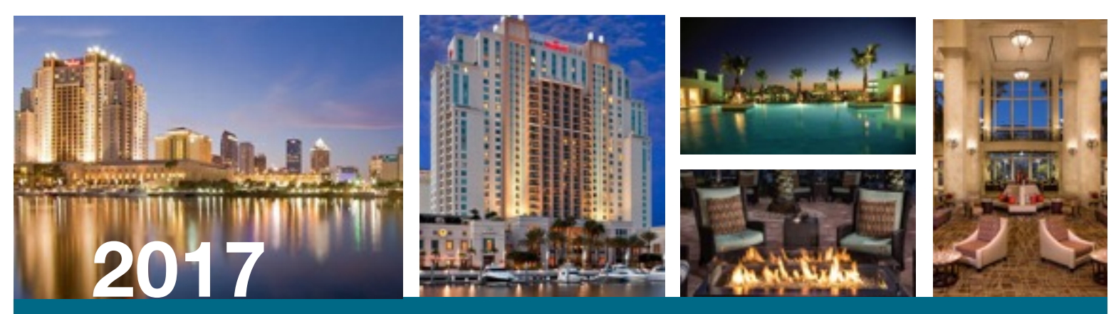
TAMPA MARRIOTT WATERSIDE HOTEL & MARINA OCTOBER 5-7