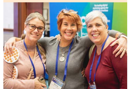
Exhibit Hall Breakdown 1:00 pm – 5:00 pm

Refreshments in Exhibit Hall: 7:30 am Coffee 9:30 am – 10:00 am Break