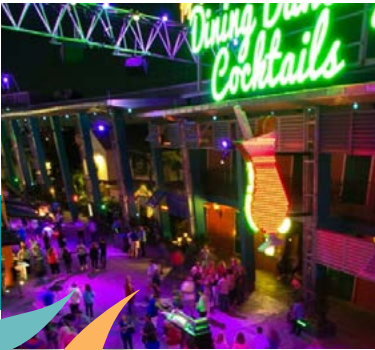
Private Block Party at Universal CityWalk

As our premier WiFi Sponsor guests will reference WiFi through your branded WiFi name and access code.