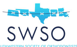
Exhibit Hall Hours (May be adjusted slightly)