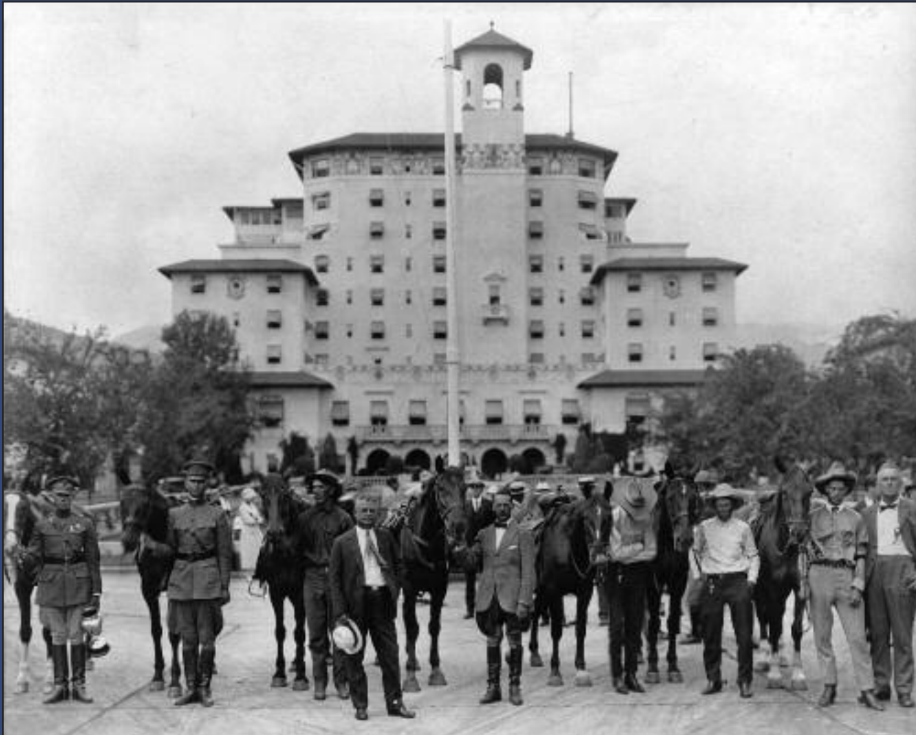
Remount Endurance Race 1923

Atlantis Paradise Island Nassau, Bahamas